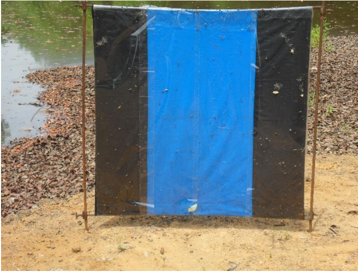
Figure 2: Target (1mx1m black/blue/ black) covered with adhesive film