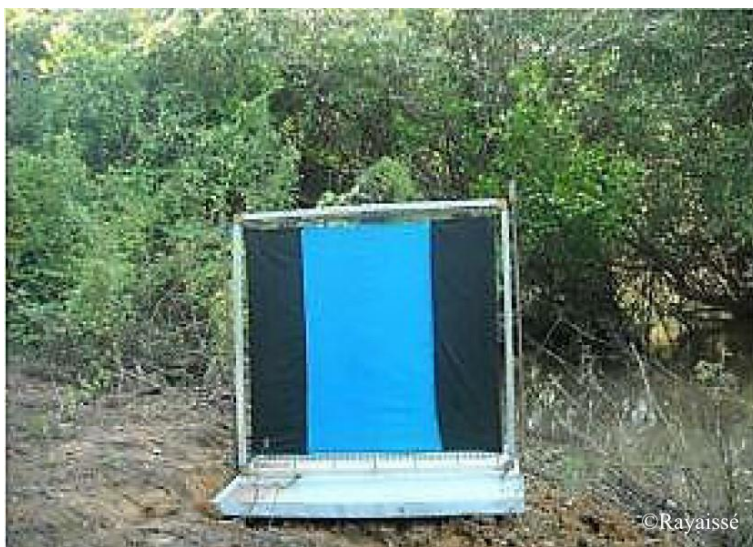
Figure 1: 1mx1m black/blue/ black target cloth inserted in electric grid

Electrocution devices (grids) designed for tsetse flies (12,25) and modified by Foil and Younger (2006) were used for cloth target evaluations in Louisiana. Grids consisted of a series of 0.18-mm diameter stainless steel wires placed 8-mm apart and strung vertically on the front and back sides of 1-m 2 aluminum frames (two electrified sides). The 1-m 2 targets to be evaluated could be inserted into the frames between the two electrified sides which intercepted and killed stable flies attracted by the targets (26). These are referred to as electric grid targets. Flies killed by electric grids are dropped to the ground into trays from which they can be removed and counted.